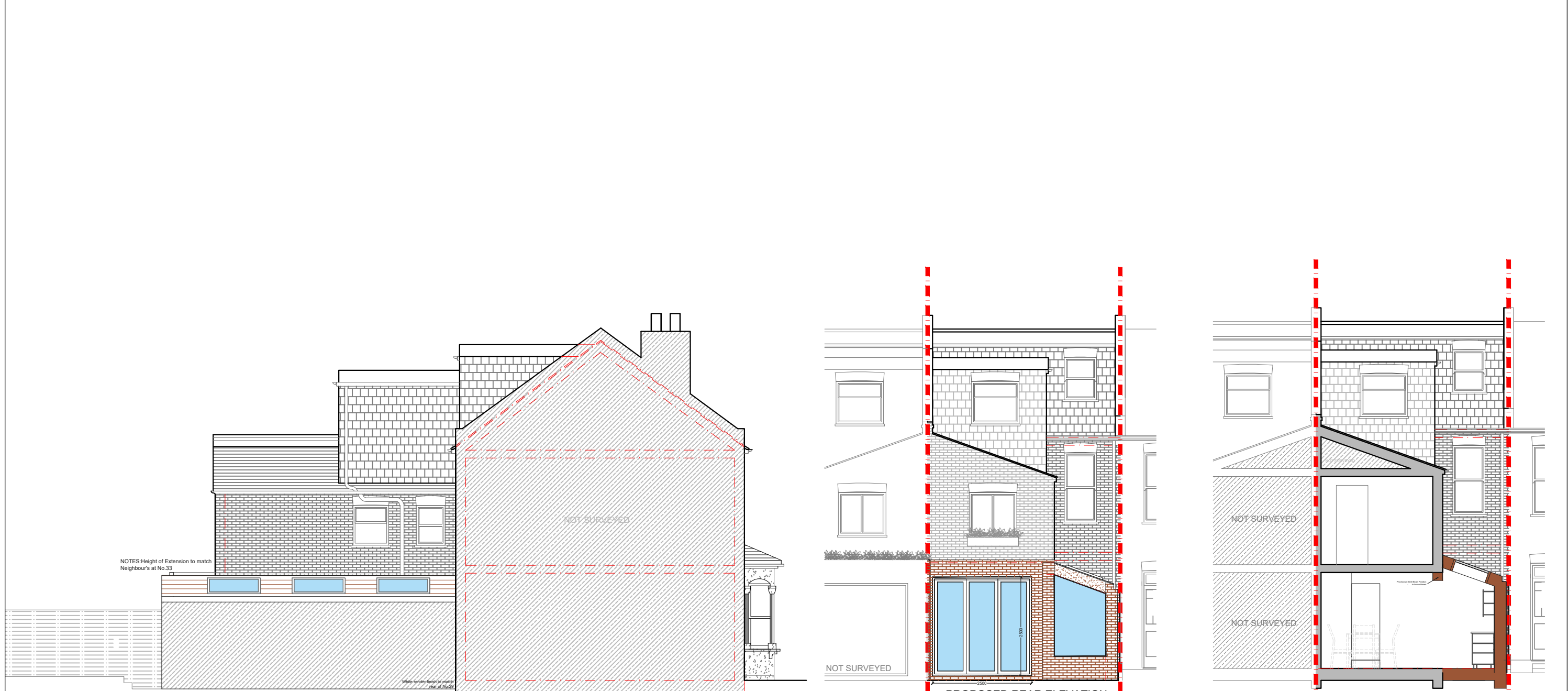
PROPOSED SIDE ELEVATION FROM NO. 29 SCALE 1:50

NOTES: All detailed measurements are approximate.