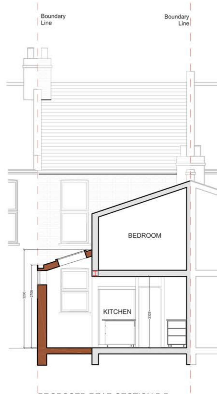
PROPOSED REAR SECTION B:B SCALE 1:100