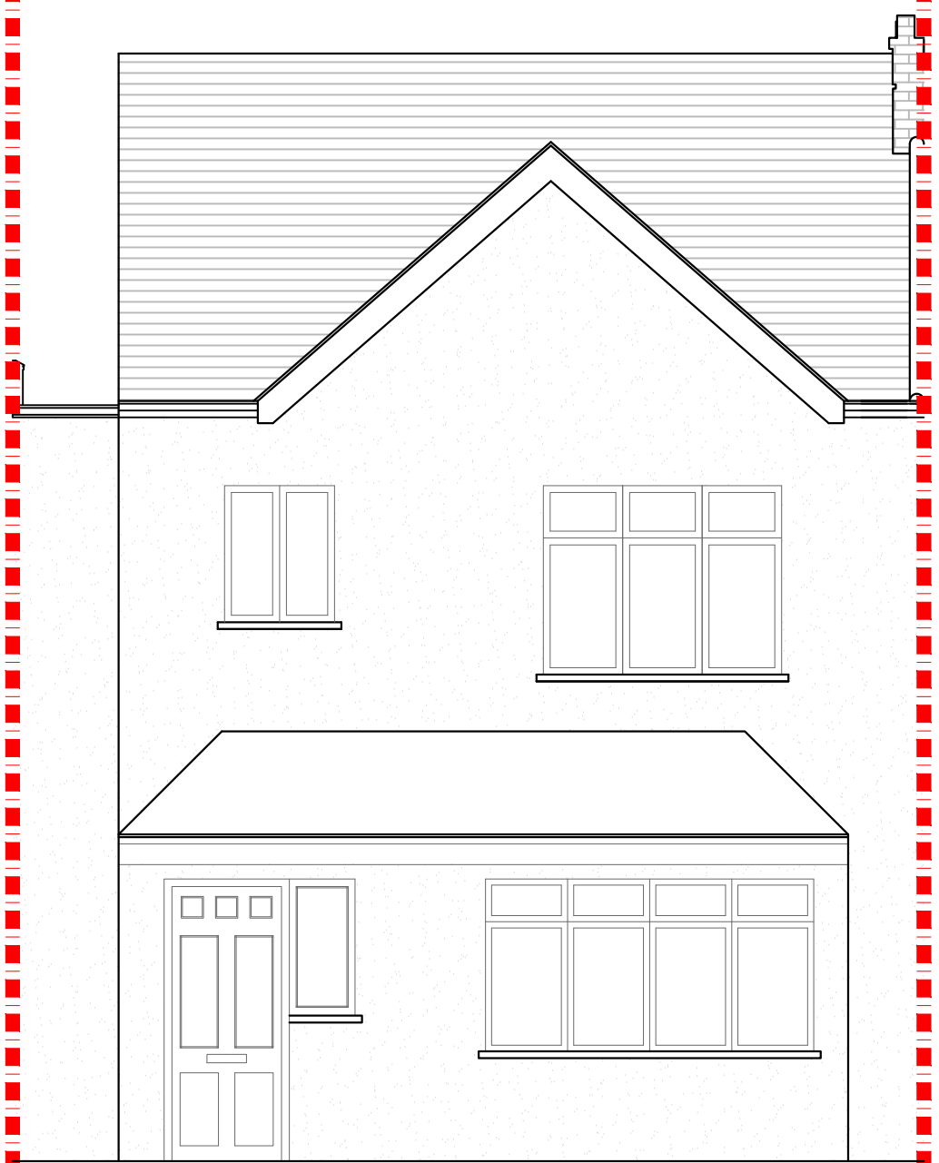
PROPOSED FRONT ELEVATION SCALE 1:50 NO CHANGE