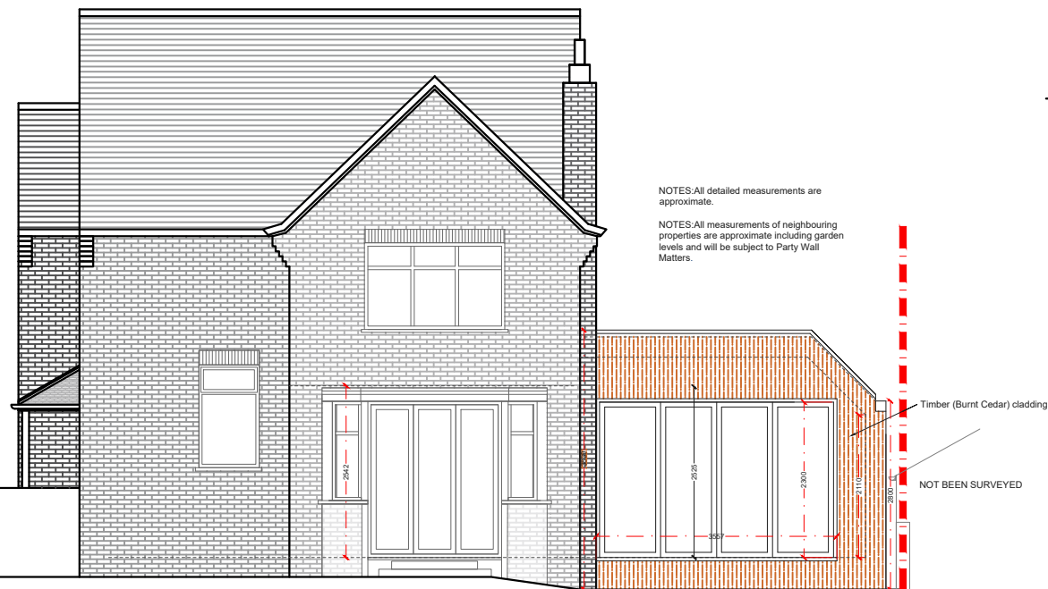
PROPOSED SIDE ELEVATION 1 SCALE 1:100