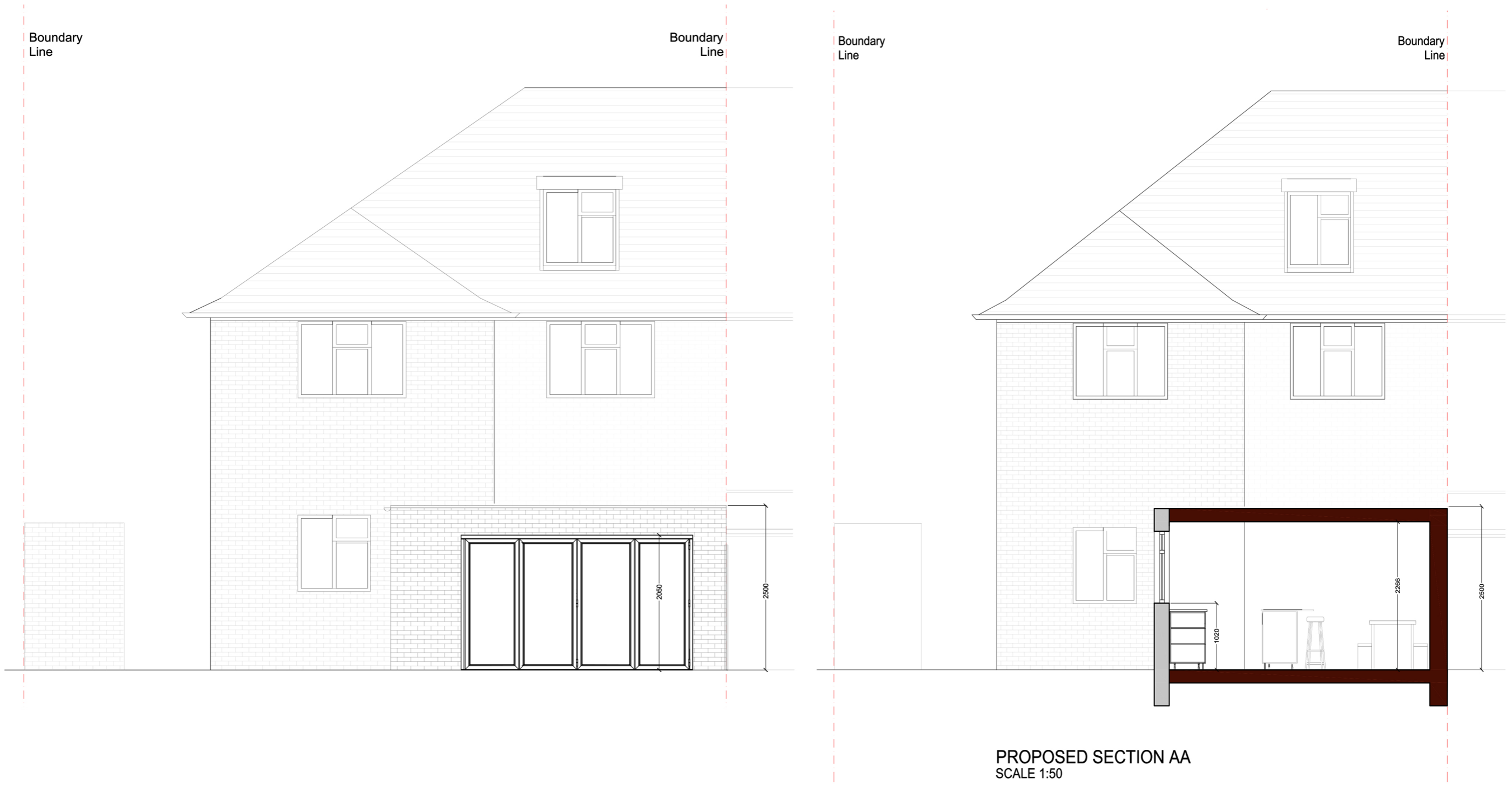
PROPOSED SECTION AA SCALE 1:50