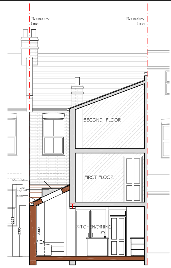
PROPOSED SECTIONAL ELEVATION A-A SCALE 1:100