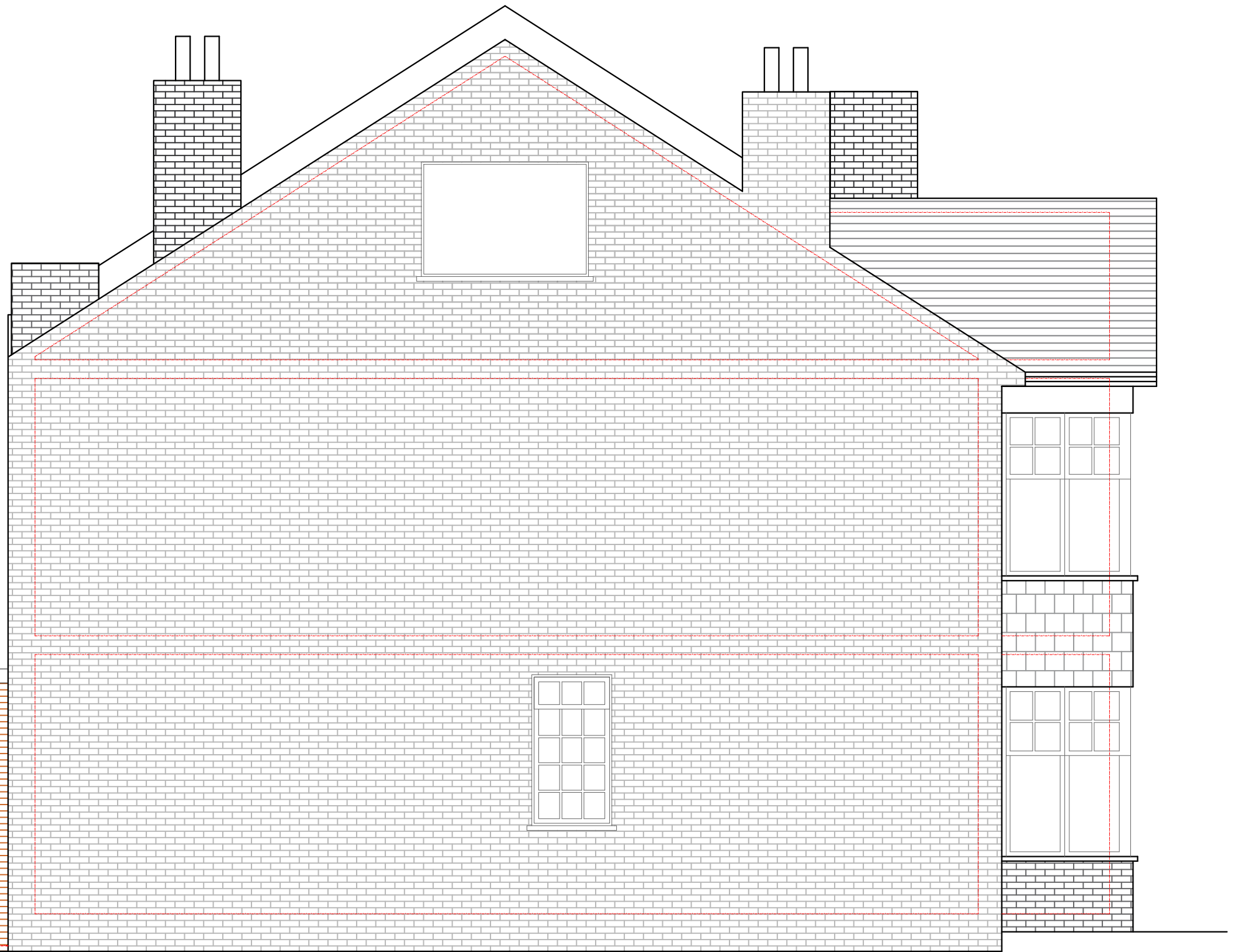
PROPOSED SIDE ELEVATION - A SCALE 1:50

NOTES: Structural calculations and depth of all foundations for the new extension is to be confirmed by the building control officer on site taking soil type and nearby trees into account prior to pouring concrete and commencement on site.