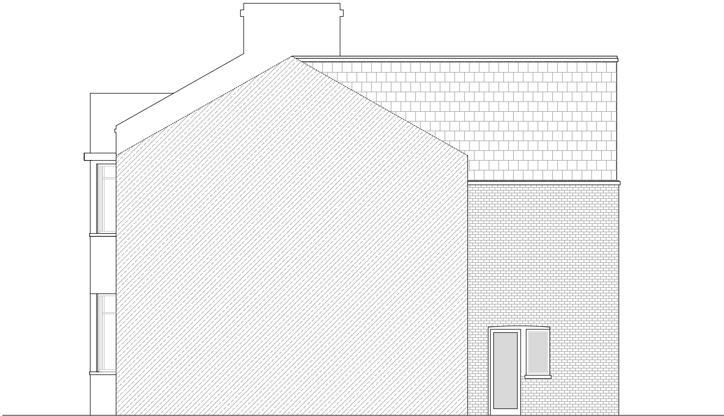
PROPOSED SIDE ELEVATION 1:50