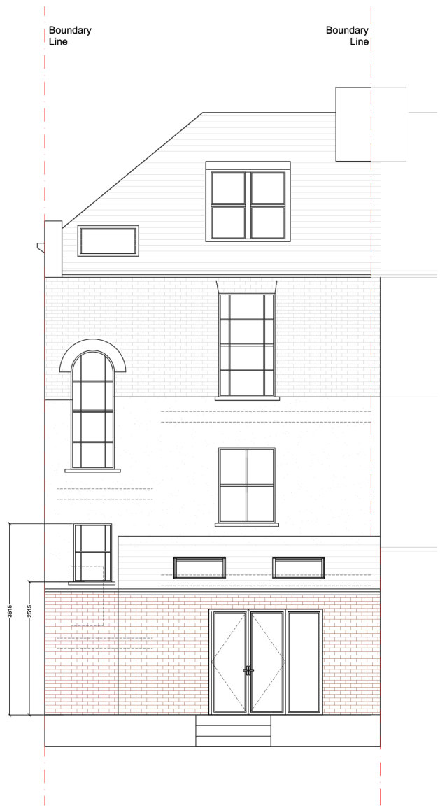
PROPOSED SOUTH EAST ELEVATION SCALE 1:100