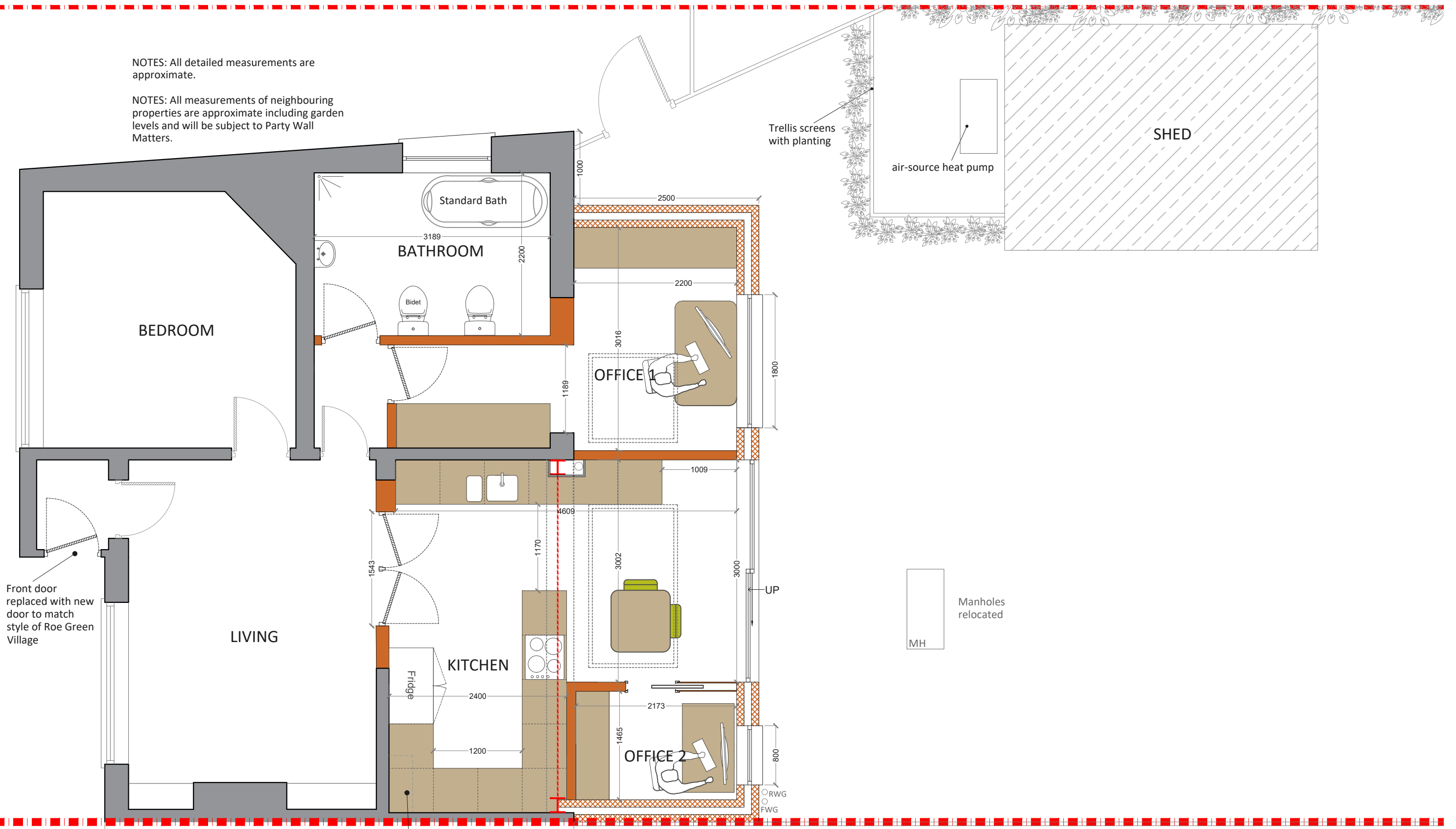
PROPOSED GROUND FLOOR PLAN SCALE 1:50

NOTES: All measurements of neighbouring properties are approximate including garden levels and will be subject to Party Wall Matters.